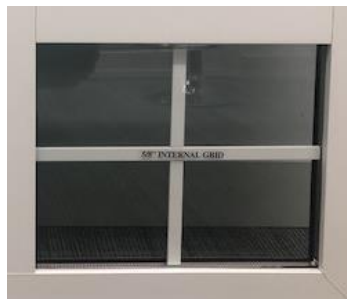
5/8" INTERNAL GRID