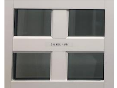
2 1/2" SDL-SB*