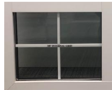
3/8" INTERNAL GRID

*INTERNAL GRID= INBETWEEN THE TWO PANES OF GLASS