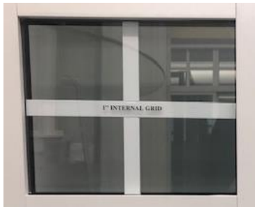
1" INTERNAL GRID*